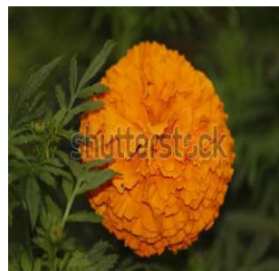
Figure 3. Calendula officinalis (Marigold). [27]