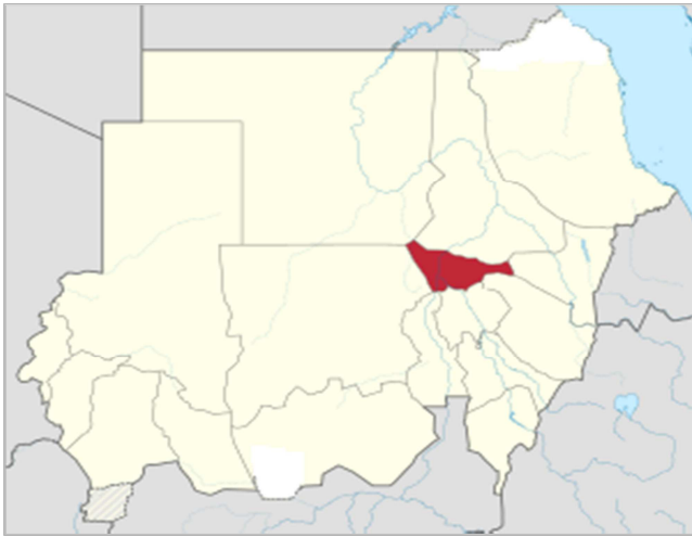
Figure 1. The study area- Khartoum State – Sudan.

The study final results illustrated that, the orthometric heights were derived with accuracies of about \pm 5 cm from the two geoid determination methods i.e. the improved local EGM2008 geoid and the interpolation method.