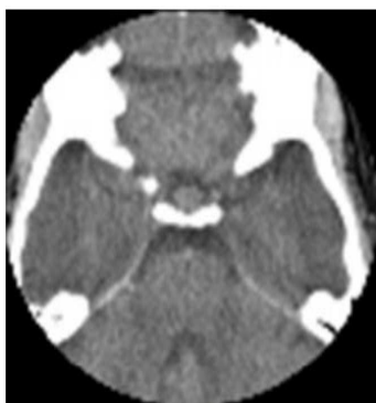
Figure 1. Computerized axial tomography (CT) of the skull (simple) described pituitary Macro adenoma.

Recruitment Commission of the Cuban army. She presented pale skin and mucosa, diffuse alopecia, and a slight increase in thyroid volume (30-35g) that was seen to be multinodular, according to the endocrinologist's review. Adequate muscle tone and trophism, with inability to squat or stay for more than three minutes in the standing position and achillean tendon hyporeflexia. No other alterations were found on physical examination.