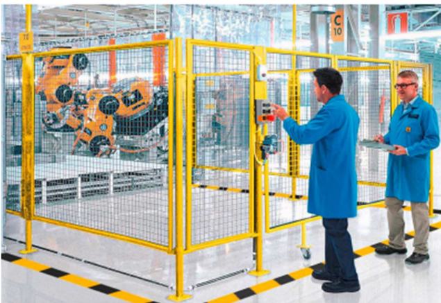
Figure 4. Siemens Safty Gridd.

It is more likely that a satisfied customer will maintain a good relationship with the company over time and this is what really matters, hence the importance of carrying out the methodology.