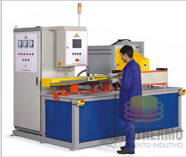
Figure 1. Laminating machine.

The project, in question presented in this work, deals with the railing of a steel laminating machine, used in a forging company, in the city of São Leopoldo, in the state of Rio Grande do Sul, in the metropolitan region of Porto Alegre, in south Brazil.