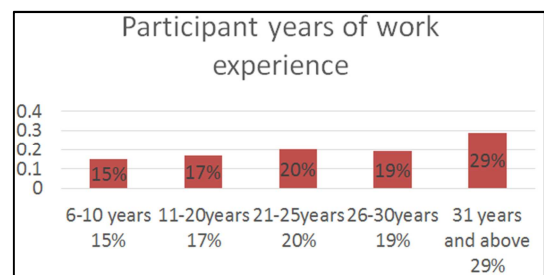
Figure 2. Distribution of the numbers of years of service among the participants.

The second section of the analysis was the numbers of years of working experiences of the participants in the field of fire safety, and in the building industry, this section was broken down into five categories which include, 6-10 years, 11-20 years, 21-25 years, 26-30 years, and 31 years and above,