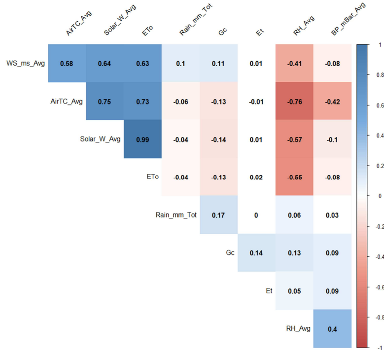
Figure 1. Correlation matrix of Canopy Conductance(Gc) and climate variables.

Figure 1 shows the correlation matrix of cocoa canopy