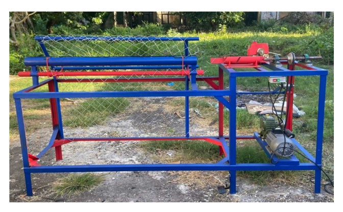
Figure 3. Harmonica Wire Forming Equipment Products.

the harmonica wire mold will be bent by the wire bending plate. The bending plate is driven by an electric motor, then press the push button on the power generated from the electric motor will be forwarded to the gearbox using a fixed clutch, the power coming out of the gearbox will rotate the pulley and then the pulley will rotate the V-bell. When the pedal is pressed it will pull the alternating towards the tensioner, then the tensioner will press the V-bell, the pressed V-bell will rotate .