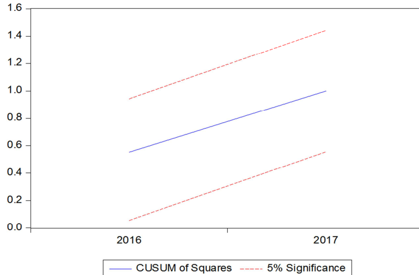
Figure 2. The CUSUM of Squares Test for Stability.

The cumulative sum (CUSUM) of squares lies within the 5% upper and lower bounds. The implication is that the coefficients are stable. This is shown in Figure 2.