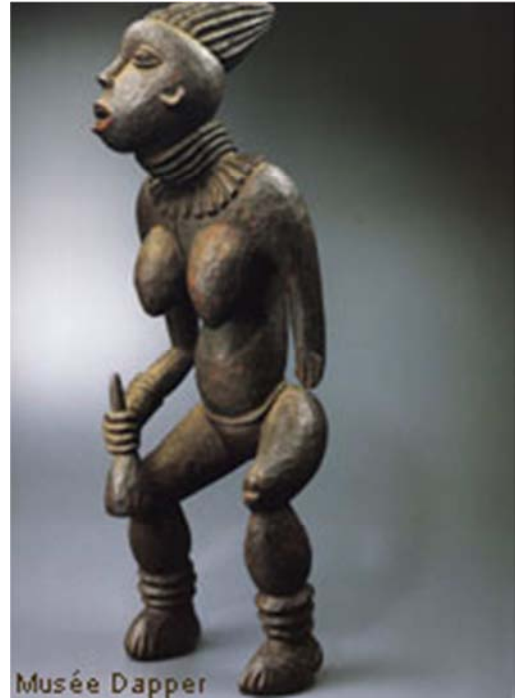
Figure 6. PRINCESS BANGWA, Bamileke, Walker Evans, American, 1903-1975.

Faced with the diversity and sometimes the rare quality of Bamileke art objects still present in the chiefdoms as support and expression of the chief's authority, one immediately feels the impression of complex symbolism and spirituality. The combinations, the abstraction, the geometrisation of the painted, braided, chiselled or sculpted figures. Everything shows that art is the essential activity of this civilisation, sculptural art, particularly the most widespread form of artistic expression.