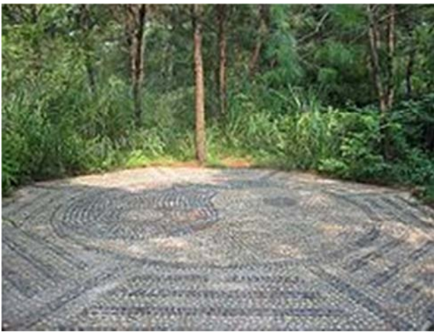
Figure 7. Yi Jing is often represented by the "Taijitu" surrounded by the eight trigrams, Yi Jing-Wikipedia, fr.wikipedia.org.

The Yi Jing [38] or "Classic of Changes" is a work that is both an energetic map of the world and a divinatory practice accessible to anyone wishing to experience it. Moreover, it is a book that allows you to live serenely in a fickle world since it explains all-natural and human phenomena.