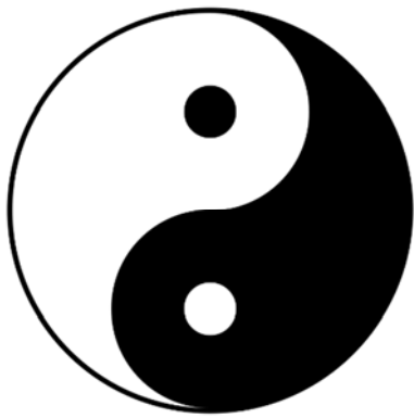
Figure 2. Symbol of yin and yang.

In Chinese philosophy, Yin and Yang [13] (Figure 2) are two complementary categories used to analyse all phenomena of life and the cosmos. These two notions, far from being antagonistic, complement each other for balance and productivity in existence. In the artistic field, too, this antagonistic concept has always existed, thus governing the conception and realisation of Chinese artistic productions.