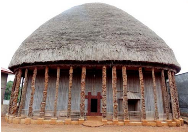
Figure 5. The traditional Bamileke architecture, Nofi Media.

The Bamileke architecture is quite atypical and responds to very complex social rules. Indeed, depending on the status one occupies within the chiefdom where one will live, it will be different; that is, it will have its architecture. Thus, the vaulted-roof architecture is reserved for the village chiefs and notables (Figure 5).