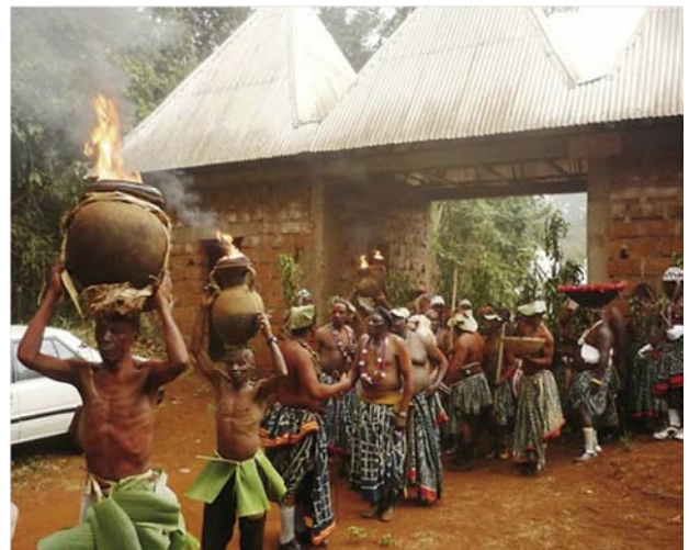
Figure 8. The official exit of the initiates to the power of kè among the Bamileke, Bamileke/Visiting Cameroon, www.editions2015.com.

"There are among the Bamileke a large number of rites intended to maintain the fertility of the group, which are addressed either to the ancestors or to the local deities. All of this necessarily leads to magical acts or practices, inseparable from religious beliefs. Proof of this is, for example, that the term which is used to designate everything that has a magical side, represents at the same time an important agrarian rite and the rite of passage for adolescents".[37]