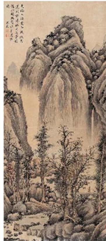
Figure 1. Traditional Chinese painting, Ming Dynasty.

Raphael PETRUCCI [7] mentions that Taoism gives pride of place to the periodicity of phenomena such as the movement of the sun, the moon and the apparent movement of the stars, fixes the idea of number and harmony to which the moral law is attached to wit rights and duties. It is an abstract principle within this gigantic creation of which humanity is only one part. This conception expressed in the 12th century BC was to direct the development of Chinese thought [8] and, therefore naturally, artistic creation, in this case, painting, to the present day.