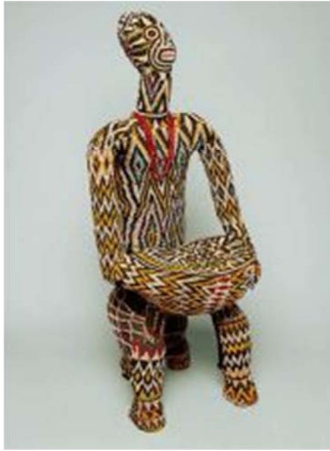
Figure 4. Beaded seat, reserved for the chef, Bamileke, galerie-art-africain.com.

Still, on the subject of the sculpture of the Bamileke people, Marie-Louise Bastion affirms that the forms swell and distort. There is an attempt to translate the movement into limbs that stretch out disproportionately, sometimes by asymmetry. The physiognomies are imbued with dynamism, rendered by the masses' outrageous balance, which combines in a beautiful architectural construction. Extraordinary combinations equate the human being with the animal kingdom, chosen for its symbolism.