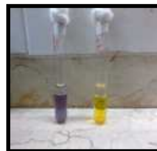
Figure 1. Decarboxylation of ornithine.

Although the sensitivity of coagulase-negative staphylococci to antibiotics is unpredictable, and depends mainly on the species and the origin of the isolated strain (hospital or out-of-hospital environment). The usual, to date, in S. lugdunensis is its sensitivity to all groups of antibiotics used in the treatment of staphylococcal infections, including penicillins, which is consistent with the literature consulted, [8-12] Since similar results were obtained in this study, as the production of \beta -lactamase was negative, the isolated strains were sensitive to most of the antimicrobials used, including penicillins.