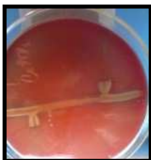
Figure 2. Detection of hemolysin \delta -like.