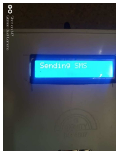
Figure 7. Sending SMS from the implemented system to the registered phone number.