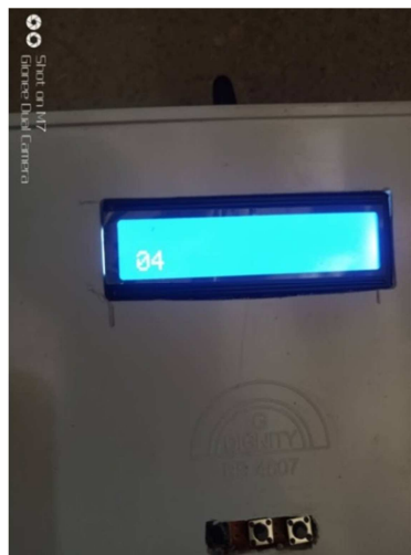
Figure 6. The implementation results show serial number 04 present.