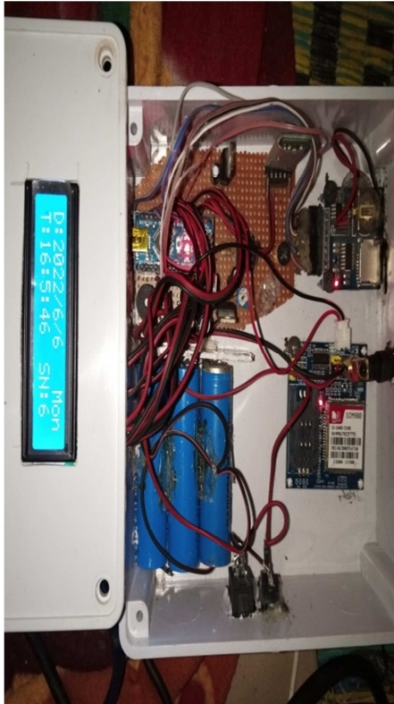
Figure 1. The complete implemented system.