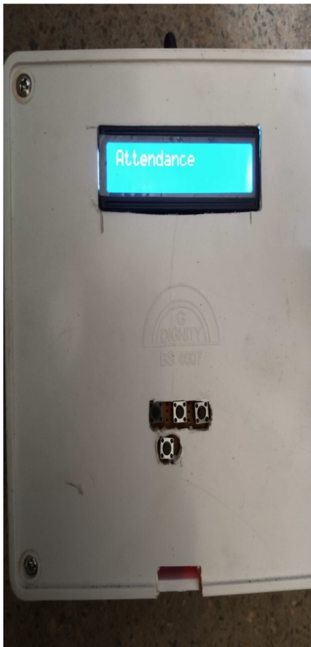
Figure 2. The Implementation result displays the research title.