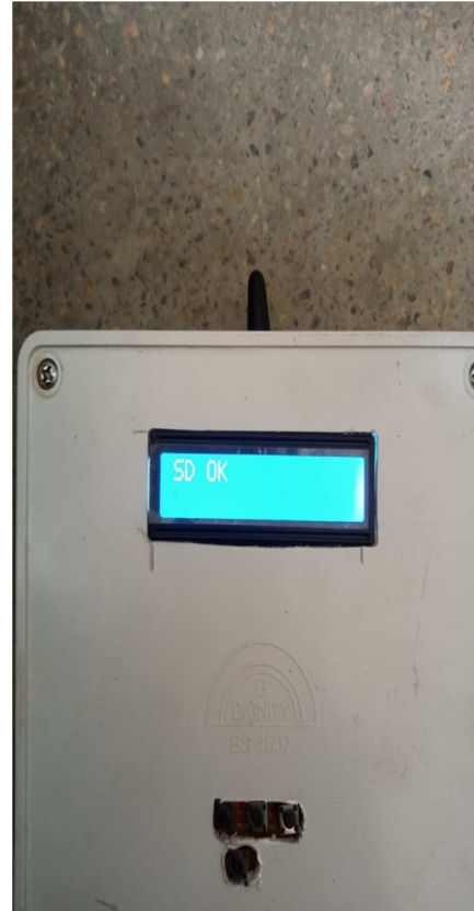
Figure 3. Displaying SD Card is OK.