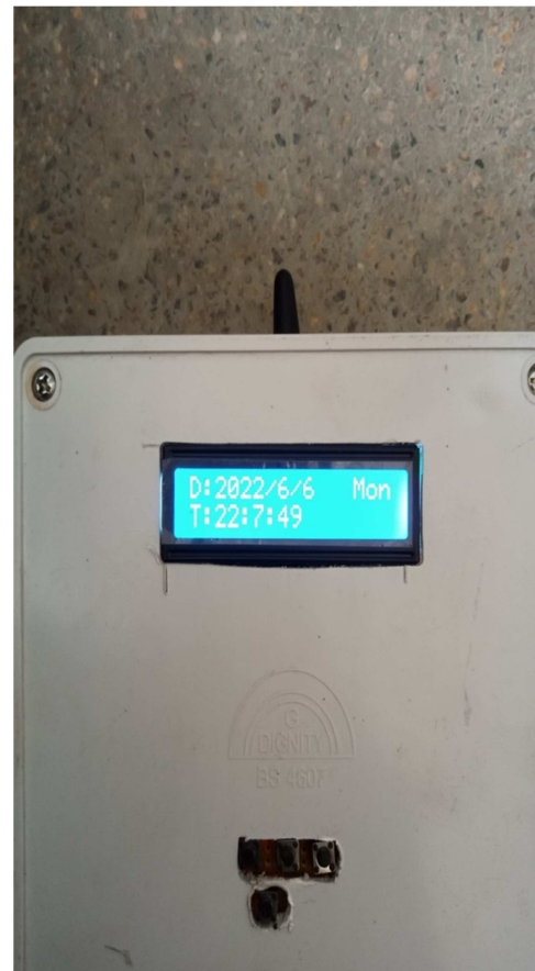
Figure 4. The implementation result displays the real time and year.