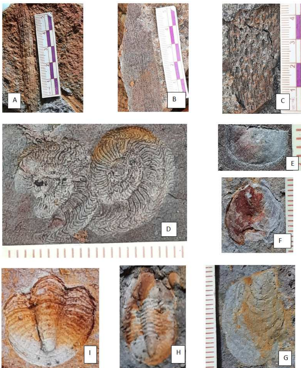
Figure 2. The fossil assemblages in the Upper part (Member 3.3) of the La Khe Formation: A –Plant Archaeocalamites sp., B –Plant Sigillaria sp., C –Plant Lepidodendron sp., D –Ammonoid Sulcogirtyoceras cf. limatum , E –Brachiopod Chonetes sp., F –Brachiopod Lingula sp., G –Bivalve Mytilarca sp., H –Trilobite Linguaphillipsia cf. subconica , x 5; I –Trilobite Phillipsia propinqua , x 5.

Upper Member is composed of mainly pinkish-grey siltstone with some interbeds of yellow medium-grained sandstone, 120m thick. The abundant fossil assemblages of plants Archaeocalamites sp., Sigillaria sp., Lepidodendron sp. associated with brachiopods Plicatifera sp., Chonetes sp., Plicochonetes sp., Schellwenella sp., Productus sp., Camarophoria sp., Lingula sp.; bivalve Mytilarca sp.; ammonoids Sulcogirtyoceras cf. limatum , Neoglyphioceras sp.; trilobites Linguaphillipsia cf. subconica , Phillipsia propinqua of the Late Viséan age has been found. The La Khe Formation underlies the Muong Long Formation in the ascending order with not clear contact, it seems a tectonic contact.