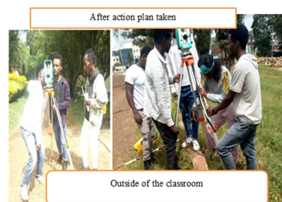
Figure 3. Participation of students outside of the classroom.