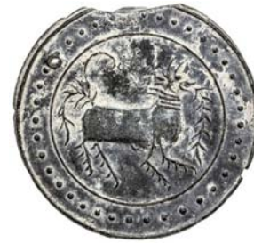
Figure 4. The obverse of a coin depicting a tou .

We find the first comprehensive treatment of these coins in Phayre's previously mentioned essay, "The Coins of Arakan, of Pegu and of Burma" [10]. Phayre had served in the Tanintharyi and Rakhine (formerly Arakan) regions since 1835 and eventually became Commissioner of Rakhine in 1849. After the Second Anglo-Burmese War in 1852, he was appointed the Commissioner of Bago (formerly Pegu) province [11]. Per Phayre, these coins were of tin or a tin-lead mixture and were in use in the Myeik (formerly Mergui) and Dawei (formerly Tavoy) regions of Myanmar, where significant deposits of tin are found. He believed they also had a religious purpose, as they were frequently deposited "in the relic chambers of pagodas" [10]. One specimen, weighing 11.75 ounces and depicting a hin: tha , or Brahminy duck, probably served as a marketplace weight, since such weights were frequently cast in the shape of that bird. Phayre's pictured coins also depicted a cock and a sea dragon, but the majority contained an image of a tou: , a mythological creature he described as a cross between a horse and deer (see Figure 4 for a representative coin).