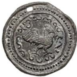
Figure 9. The obverse of the Dhagaji' 971 Coin.

great importance in correctly dating these coins (a similar specimen in Robinson [16] is so deteriorated the rest of the inscription cannot be read). To the right of khan , and starting at the 12 o'clock position, we find the word and numbers dhagaji' 971 , which means Myanmar Era 971, or 1609 CE [12]. This is the only Tanintharyi coin reviewed herein with a certain date (Lot 1011 with a possible date will be addressed below), and confirms the issuance of these coins as early as the beginning of the seventeenth century. Although this translation may be a first outside Myanmar, Myanmar collectors would have probably read the entire inscription when this type was originally found as dhagaji' is found on several nineteenth century Myanmar coins. We will call this the " Dhagaji' 971 Coin."