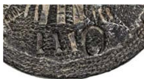
Figure 11. A close-up of the date of the 1118 Coin.

Whether this date, if valid, represents the year coin was made or commemorates an historical event is not presently known. The research for this article has not identified an historical event in Tanintharyi in 1756 CE. The utilization of three Arabic "1's" would, however, indicate a European influence, a definite possibility since Portuguese, Dutch, French and English traders were present in Tanintharyi during this period [20, 18, 8, 28]. The author considers this date possible, but not certain, and proposes it solely for consideration. We should note that the utilization of retrograde writing and older and dialectal spellings makes translation of these coins more of an art than a science and subject to reasonable differences of opinion. This specimen, probably unique, will be called the "1118 Coin."