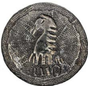
Figure 10. The 1118 Coin.

Lot 1011, Auction 33: this is a uniface cast tin-lead weight of 125.98 g (4.45 ounces), 60 mm in diameter (2.36 inches), depicting the crude outline of a bird, probably a hin: tha , surrounded by a stippled field. The SARC cataloguer characterized the four figures at the six o'clock position as parts of the bird's body, but I respectfully submit a different interpretation of these figures for consideration. This four figure inscription is completely separate from the bird's feathers, feet, tail and the five vertical strokes on both sides of the body that probably denote the ground or grass. The inscription appears to consist of three Arabic numeral "1's" and a Burmese eight (which has the general appearance of an upside-down "u") or the date 1118 Myanmar Era, 1756 CE (Figures 10 and 11).