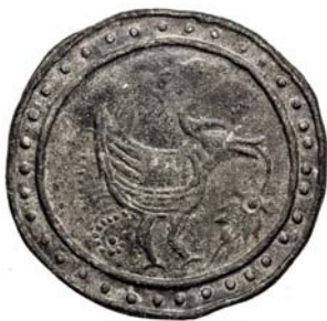
Figure 6. The obverse of a coin containing the 1-1-1-6 mnemonic device.

See Figures 16 and 17 for a coin of this type. Her source for this is U Than Swe, a local collector and historian, but no further explanation of the mnemonic device is provided. In an email exchange, Moore and a colleague advised the mnemonic for the founding date of Dawei appears to utilize the letters corresponding to the date’s numbers in the Burmese astrological system. Those letters can be recalled through the bird’s name (“Oh-aw”), which is probably the ou’ o: [12] bird, or Asian koel found in India, China and Southeast Asia [23]. It is represented in this coin, they pointed out, through the shape of the bird’s tail, which of the eleven SARC coins of this type Figure 6 is the best representation. Moore advised, however, that the matter is not entirely clear [27]. What is clearer is the identification of 1116 ME (1754 CE) as the founding date of Dawei in its present location. Although the term “Dawei” had been used to label the region and its people before that time, the present town of that name is apparently only 265 years old. A king named Min-ne-hla founded it in 1116 ME, and though he originally called it Thayawaddy, it came to be known over time as Dawei [24].