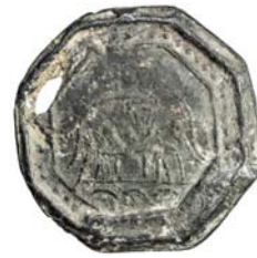
Figure 12. The obverse of Lot 1852 showing the elephant.

Lot 1852, Auction 35, September 2019: this is a large octagonal tin coin of 78.61 g (2.77 ounces), 56 mm in diameter (2.20 inches), depicting an elephant on ground facing right. Above the elephant is an inscription too worn to be legible. The reverse contains semi-circular patterns resembling waves or clouds, as in Lot 977, surrounding a small square in the center representing a Chinese cash coin (Figures 12 and 13).