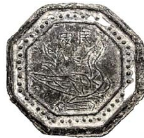
Figure 7. The obverse of Lot 977 with Chinese characters.

coin of 30.39 g (1.07 ounces), 57 mm in diameter (2.24 inches), similar to that depicted as Robinson no. 9, Plate 7.5 [16]. The obverse has a hin: tha facing right above which are two Chinese characters that do not appear to be counter-stamped and are translated by the SARC cataloguer as min an , “the people of peace.” Per the SARC cataloguer, the reverse displays “stylized Burmese characters” that Phayre called chaitya , or stupa-like semi-circles [10], but on these coins have the appearance of wave or cloud patterns. The square device in the center, once characterized by Phayre as a pagoda relic chamber [10], is now believed to be a representation of a Chinese cash coin the purpose of which was to designate the item as money (Figures 7 and 8).