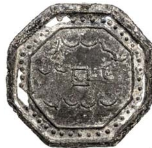
Figure 8. The reverse of Lot 977 with a cash coin square.

The octagonal shape probably dates this coin to the 17 th century, per Tavernier’s observations, which when combined with the Chinese characters provides evidence of Chinese communities in the Tanintharyi region as early as the 1600’s, although evidence for their presence in Myeik during the 1500’s has been uncovered [25].