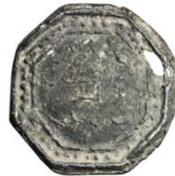
Figure 13. The reverse of Lot 1852.

Although considerable wear, or poor casting, takes away from the overall appearance, the coin is unpublished and only one other elephant type has ever appeared for sale, in SARC's Auction 37 of June 2020. As noted by the SARC cataloguer, all previously published octagonal types depict either lotus buds, a hin: tha or a sea dragon, and of the two elephant coins now seen, this is the superior specimen.