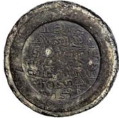
Figure 15. The inscription side of Lot 1854.

As previously mentioned, Robinson called this writing medieval Mon-Burmese, while Phayre believed some of the letters were Persian. According to the SARC cataloguer, this is the heaviest Tanintharyi weight ever found and one of the finest known of this type. Prior to its appearance the heaviest specimen was Robinson Plate 5.4 at 456.85 g [16].