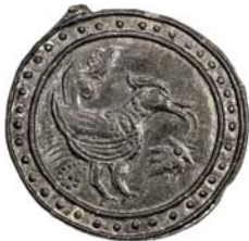
Figure 16. The obverse of the Dawei Coin.

Lot 1866, Auction 35: this is a tin coin of 52.70 g (1.86 ounces), 69 mm in diameter (2.72 inches), depicting on the obverse a hin: tha or rooster-like bird facing right with an elongated tail and holding a nine-leaf branch in its beak. The reverse contains the Burmese word tawe: , an older spelling for the city of Dawei, and demonstrates a superb casting of the type first published in Moore [21] (Figures 16 and 17).