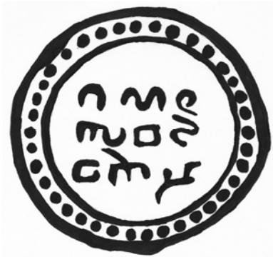
Figure 5. The cabbalistic inscription on the Mitchiner coin after rotating it 90 degrees.

letters, older or dialectal spellings and retrograde style becomes ganagara. ka la. thu. kha. , or “City and age of happiness” [12], the only type encountered to date that contains a significant variation of “City of great happiness.”