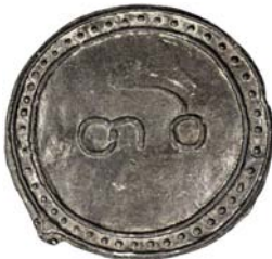
Figure 17. The reverse of the Dawei Coin.

The SARC cataloguer describes this specimen as the finest of the eleven Dawei specimens they have sold since January 2019. We will call this the “Dawei Coin.”