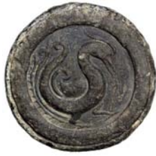
Figure 14. The obverse of Lot 1854, the largest lead weight found to date.