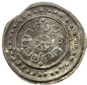
Figure 3. The backwards Burmese inscription that Temple alleged was Arabic.

Temple apparently never saw this article, for if he had it might have prevented his misidentification of these backward Burmese inscriptions as Arabic. Benjamin Nightingale, who submitted the Burmese writing, noted that these coins were used into the nineteenth century along the coast of Tanintharyi as far as Yangon, and in larger transactions would not be counted out individually but would be weighed in baskets [4].