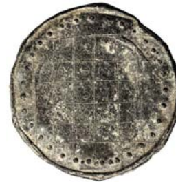
Figure 18. A coin with an overwritten cabbalistic in:

dragon type that had the remaining features removed for purposes of overwriting a cabbalistic in: . The photo shows the most interesting side, featuring a five-by-five square containing various Burmese letters, syllables and words (Figure 18). Among the discernible words are wa , “cotton” or “period of monsoon retreat for Buddhist monks,” thei , “to die,” kho: , “small basket in which offerings are presented to evil spirits,” and maha , “great” [12]. The predominant significance appears to be religious, but dialectal variations may result in different meanings.