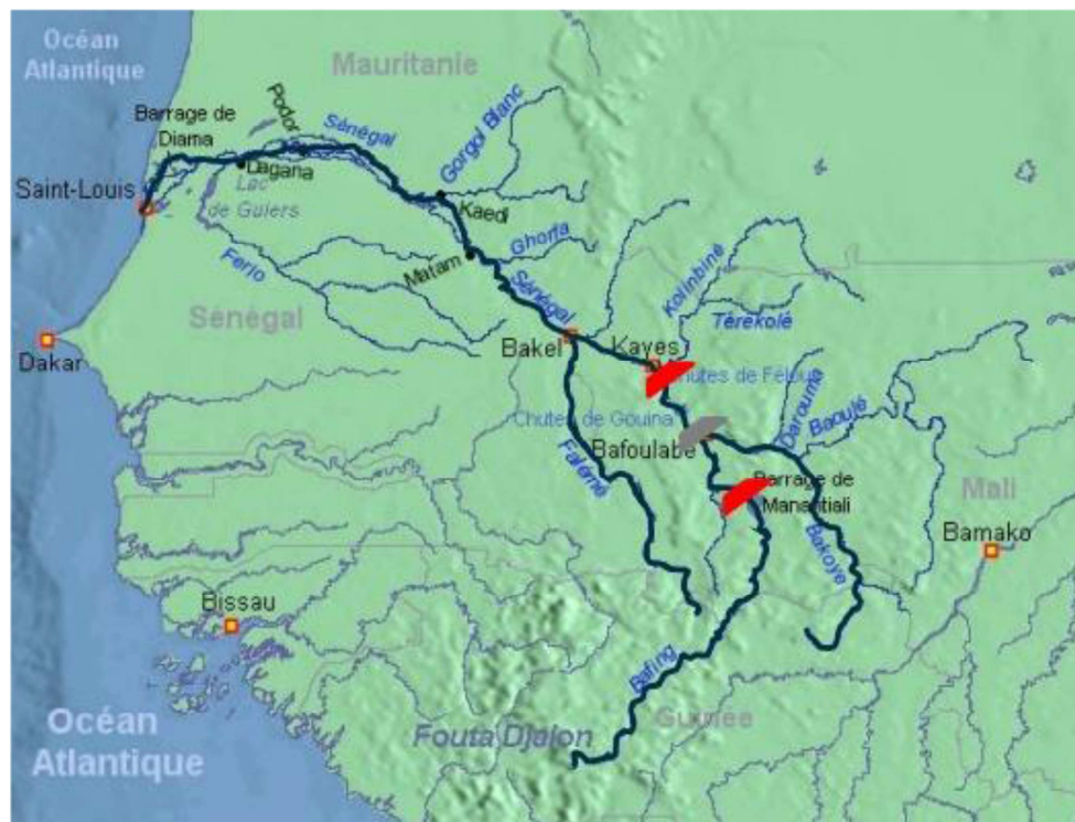
Figure 2. The Senegal River estuary.