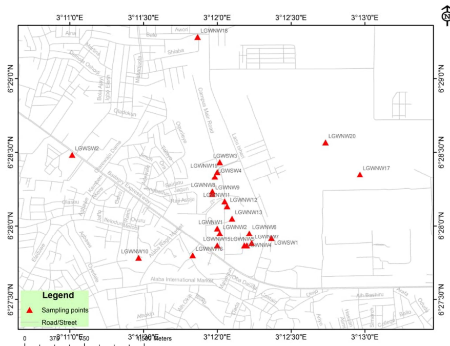
Figure 1. Map of study area showing sampling locations.

The study area is also characterized by various shallow and deep wells. The study area houses many vegetable farm lands. The main campus consist of nine Faculties, and staff residential quarters whose water supply is from groundwater processed and supplied by a micro water works.