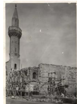
Figure 18. 3 rd mosque of the Four Mosques in the same era as the ruler and by the same architect. (Lagen-AL-Sayfi)