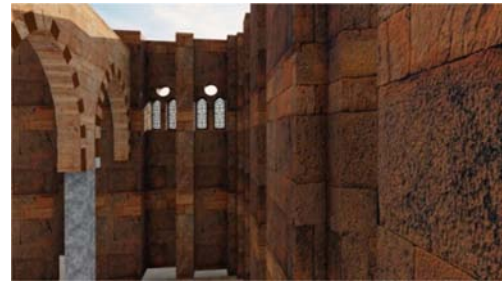
Figure 24. A virtual Model showing Windows from interior.