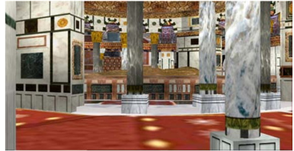
Figure 10. A virtual image showing corridors surrounding the Dome.