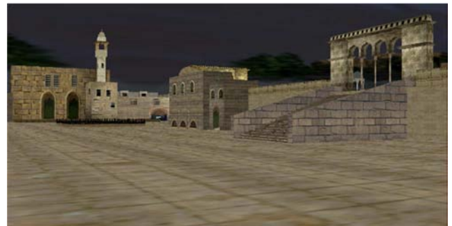
Figure 3. A virtual image showing Arcades & Some Elements.