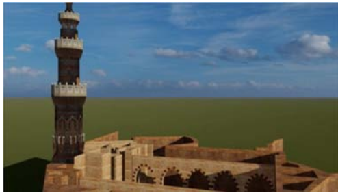
Figure 20. A virtual Model showing Badr Edeen Elwanaey Mosque Exterior.

The project had to be presented to the Permanent Committee of Islamic and Coptic Antiquities to obtain their approval for this comparative study. The proposed method provides an easy visual alternative for a quick comparison of the shape of the Mosque in the case of using the different possibilities of the forms of arches, columns, crowns and bases. A comparative analytical study was conducted to reach a 3D Virtual model to be useful in presenting an interactive Environment in Metaverse to be used by the Permanent Committee of Islamic and Coptic Antiquities to take the right restoration decision. (Figures 20, 21, 22, 23, 24, 25, 26, 27)