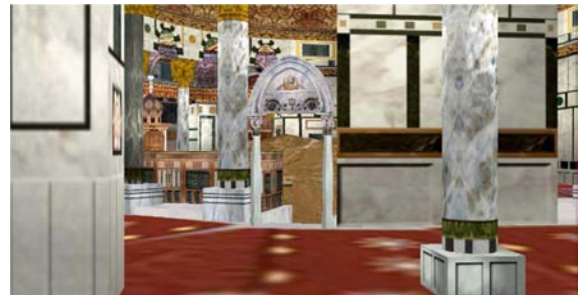
Figure 11. A virtual image to the entrance to the down stairs to the Rock.