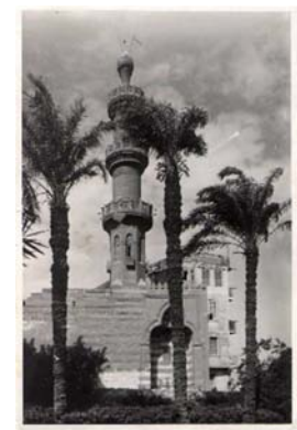
Figure 19. 4 th mosque of the Four Mosques in the same era as the ruler and by the same architect. (AL-Ashraf Qaitbay-EL-Roda)