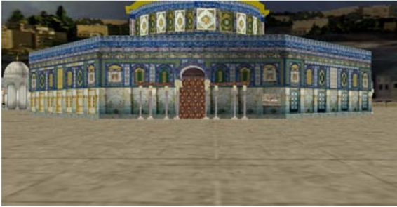
Figure 6. A virtual image showing the Dome of the Rock Exterior.