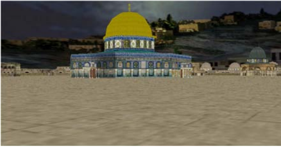
Figure 5. A virtual image showing the Dome of the Rock Exterior.