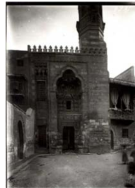
Figure 17. 2 nd mosque of the Four Mosques in the same era as the ruler and by the same architect. (AL-Kadi-Yehia Zain-EL-Din)