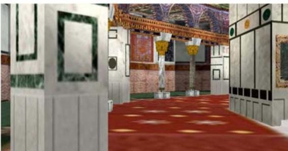
Figure 8. A closer virtual image showing columns and cornice decorations.