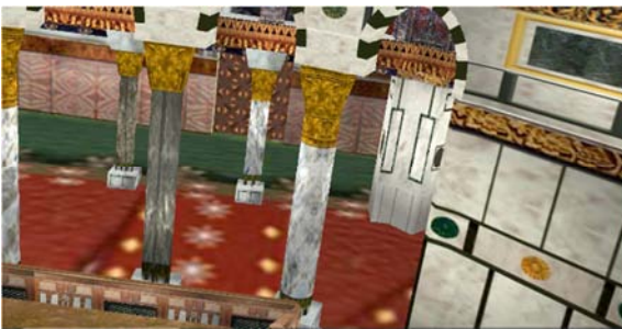
Figure 7. A closer virtual image showing the crowns of the columns.