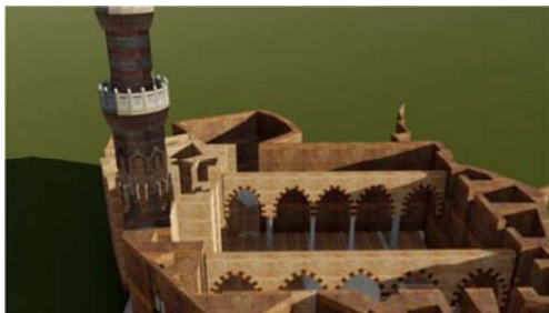
Figure 21. A virtual Model showing Badr Edeen Elwanaey Mosque Exterior.