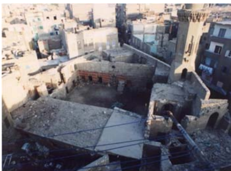
Figure 15. Ruined ruins of Badr Edeen Elwanaey Mosque.