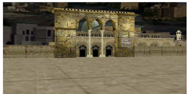
Figure 4. A virtual image showing Arcades & Some Elements.