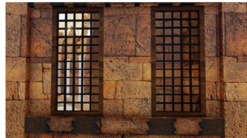
Figure 27. A virtual Model showing Windows from Exterior.