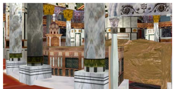
Figure 12. A virtual image to the entrance to the down stairs to the Rock.