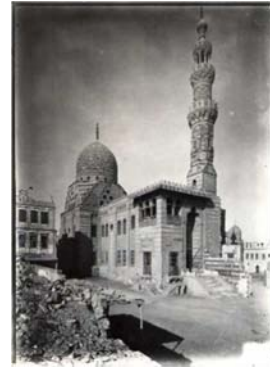
Figure 16. 1 st mosque of the Four Mosques in the same era as the ruler and by the same architect. (AL-Ashraf_Qaitbay-Sahara)