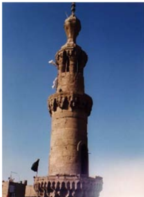
Figure 14. Ruined ruins of Badr Edeen Elwanaey Mosque.