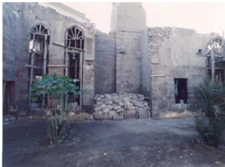
Figure 13. Ruined ruins of Badr Edeen Elwanaey Mosque.

*AL-Ashraf_Qaitbay-Sahara_99, AL-Kadi-Yehia Zain-EL-Din_204, Lagen-AL-Sayfi_217, and AL-Ashraf Qaitbay-EL-Roda_519.