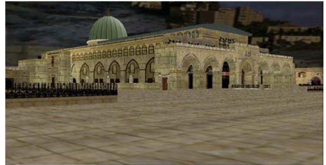
Figure 1. A virtual image showing Al Aqsa Mosque Exterior.

Models. Furthermore, figures from 1 to 6 show some virtual images of some of the external architectural elements of the Dome of the Rock and Al Aqsa Mosque. However, figures from 7 to 12 show some virtual images of some of the internal architectural elements of the Dome of the Rock such as arches, columns, crowns, cornice decorations, ceilings, inscriptions and dome windows.