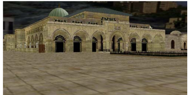
Figure 2. A virtual image showing Al Aqsa Mosque Exterior.