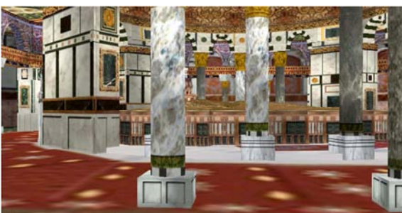
Figure 9. A virtual image showing corridors surrounding the Dome.