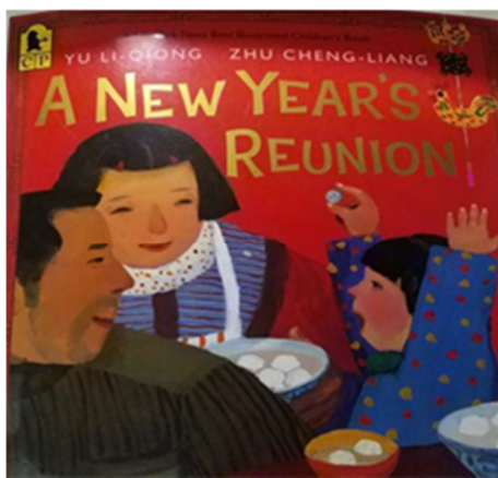
Figure 2. The Cover of English Version [13].