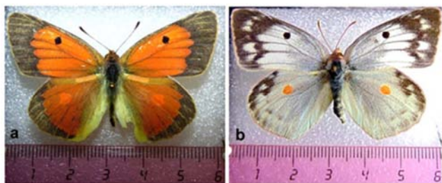
Figure 3. Colias aurorina H-S. a – male, b – female.

To confirm the correctness of visual identification, 2 butterfly specimens were caught: 1 male and 1 female (Figure 3 a, b).