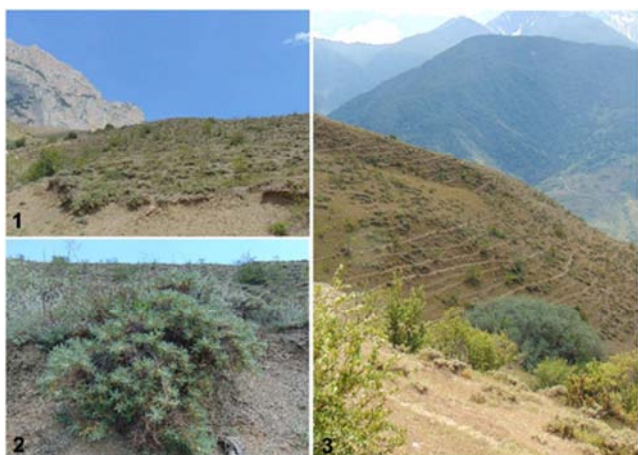
Figure 2. 1 - slope covered with tragacanth astragalus ; 2 - tragacanth astragalus ( Astracantha ); 3 - network of paths.

passes. The depression is cluttered by a powerful thickness of loose-debris geological material of various origins. Landslides, showers, drift cones, moraine and river deposits are common in this area [6, 7].