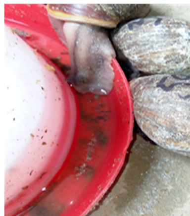
Figure 2. Snails drinking.