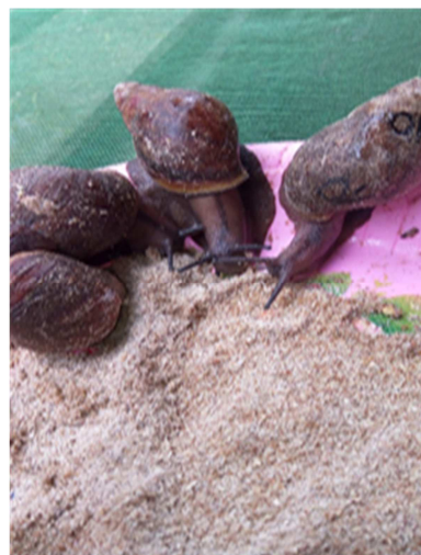
Figure 1. Snails feeding.

2540 kcal and 2089 kcal metabolizable energy per kg of dry matter were distributed at will, respectively to the snails of batches I (control), II and III. A quantity of 200 g of feed is served for each batch, twice a week (Tuesdays and Fridays) at dusk. Feed consumption is collective for the snails of each batch (see picture 1 below). Uneaten feed is weighed before a new service and after cleaning the pens. After this feed restriction phase, all batches of snails are fed for another 70 days, corresponding to the re-feeding phase, at the same level (100%) as the control batch. Drinking water is served in siphoid drinkers (see figures 1 and 2).