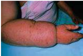
Figure 3. Lymphoedema (swollen leg).