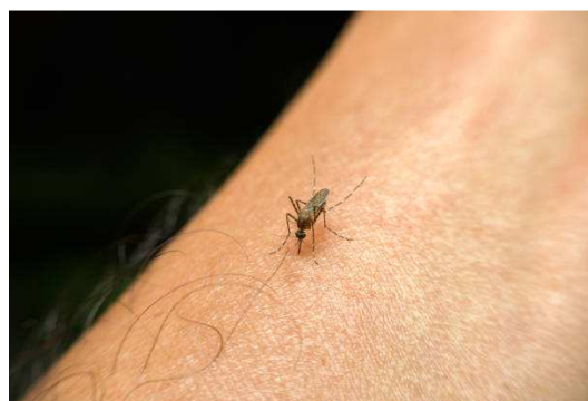
Figure 1. Nematodes (roundworms) that cause Lymphatic filariasis (elephantiasis).