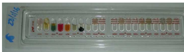
Figure 1. Biochemical characteristics of Pseudomonas aeruginosa .

Pseudomonas aeruginosa is characterized by Urea (-), Oxidase (+), Gelatin (+), ADH (Arginine) (+), TDA (Tryptophan) (-). The figure below summarizes its biochemical characteristics.