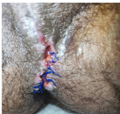
Figure 2. Revision of the wound from the previous operation before 1 month, excision of the lesion along the middle line of the scrotum and adaptation of the skin edges.

After a month, the patient re-appeared at the department with painful edema and redness of the scrotum. He had a blood pressure of 135/95 mmHg, heart rate of 74 /min, and