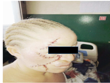
Figure 2. Direct suture after wide resection of squamous cell carcinoma of the cheek in a 34-year-old patient on day 1 post-op.

Follow-up was greater than 6 months in 15 (45.5%) patients. In terms of evolution, remission was complete in 20 (46.5%) patients (Figure 3). Recurrence occurred in 4 (9.3%) patients. Recurrence was local in 3 (75.0%) patients and locoregional in 1 (25.0%). 13 (30.2%) patients are still alive, 10 (23.3%) patients have died and 20 (46.5%) patients have been lost to follow-up.