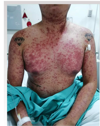
Figure 1. Purpuric and petechial lesions.

Erythematous and dry nasal mucosa with myeliceric scabs. Oral mucous with multiple vesicles and myeliceric scabs on lips. Also hemorrhagic ulcers and pseudomembrane formation in tongue and cheek, erythematous and edematous oropharynx ( Figure 2 ). Bilateral Conjunctival mucosa presents bulbar conjunctivitis, purulent secretion, bilateral tearing, palpebral edema with overlying purpuric lesions and intense ocular pain. ( Figure 3 ).