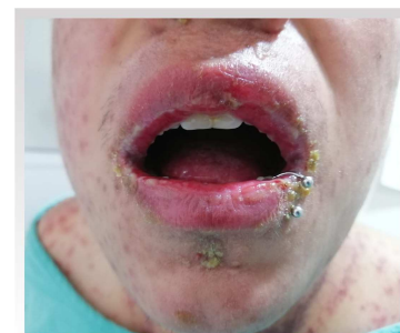
Figure 2. Hemorrhagic ulcers and pseudomembrane formation in tongue and cheek.

Clinical Features starts five days prior his hospitalization with the presence of erythema, tearing, pruritus and foreign body sensation on both eyes. 24 hours after, he starts with asthenia, adinamia, odynophagia, sialorrhea, and solid dysphagia, febricula at 37.5C also with generalize, non pruritic and painless d dermic lesions with incipient gradual distribution at upper limbs and palms progressing to trunk, face and finally lower limbs and soles.