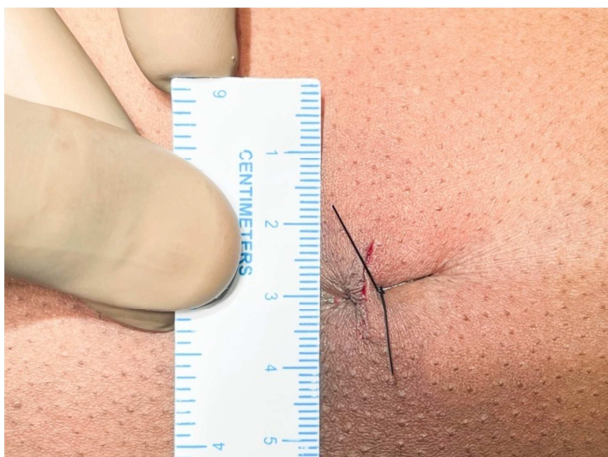
Figure 4. Sutured wound of supine mini-percutaneous nephrolithotomy puncture site.