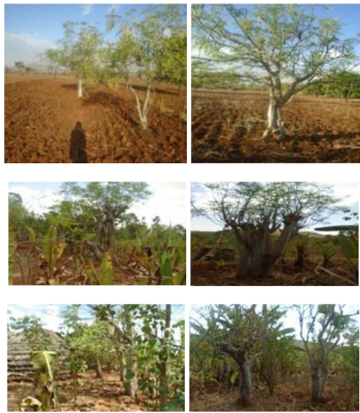
Figure 3. M.stenopetala planting practice at homegarden and scattered intercropping in site.

from respondents (24%) preferred it as scattered tree on the farm land (see below figure 3).