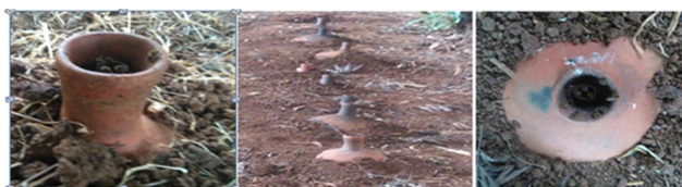
Figure 3. Established stingless bee colonies.

FREGs groups. All the colonies were kept under the shades of each apiary. All necessary managements such as feeding, controlling hive temperature/shade, and protecting against the attack of enemies (pests) were regularly performed.