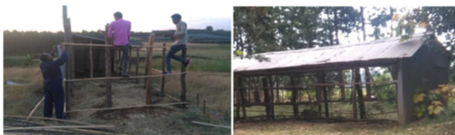
Figure 2. Shade construction.