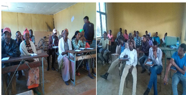
Figure 1. Theoretical training for stingless beekeepers, experts, and Das.