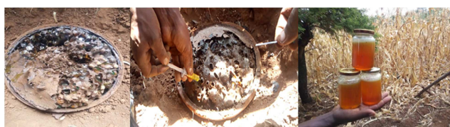
Figure 4. Honey harvesting system.

during the dearth period. From the demonstration average of 620mL of honey per pot /period was harvested at Toke Kutaye. On the other hand, one FREG site (Wol Mara) was failed after the stingless bee colonies were adapted in a good performance and stayed for one year, due to unknown reasons. All data were collected except honey yield data.