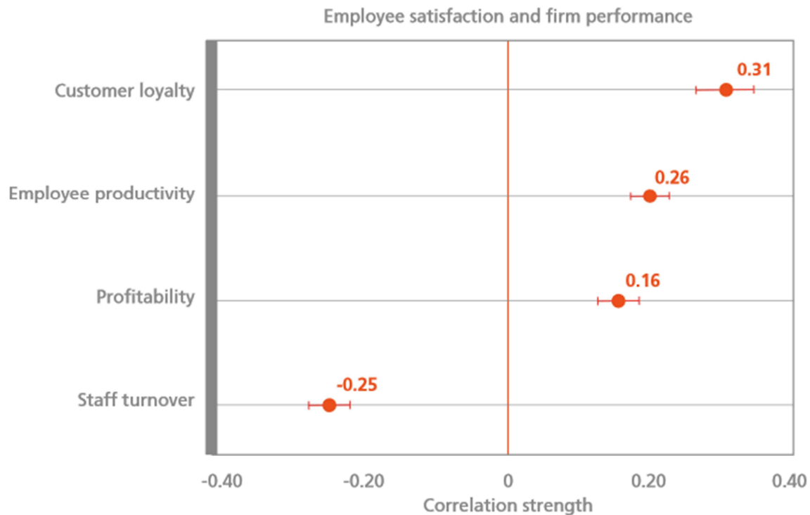
Figure 1. Correlation between employee satisfaction, productivity and firm performance (Gallup client database, 95% confidence intervals).

Figure 1 shows correlations between employee wellbeing, employee productivity and firm performance.