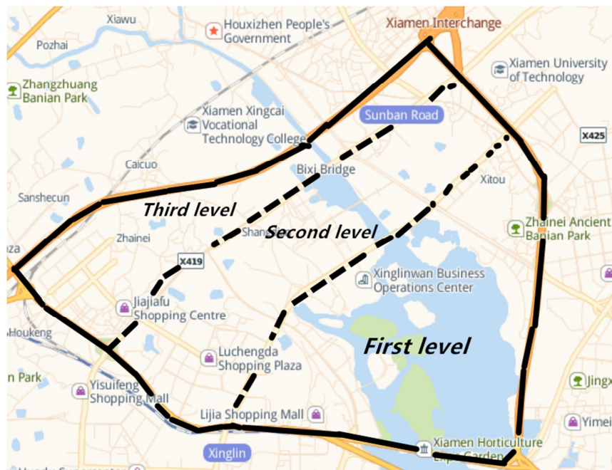
Figure 2. The different level classification of the lands surrounding Xiamen Park Expo Garden.

since September 23, 2007 officially open to visitors, on October 8, 2007 land auction in Xiamen, Xiamen residential construction group with 1.6 billion Yuan get the 2007 jg03 plot of the plates of almond-shaped bay garden show park (now in plots of "garden, no. 1"), the floor price of 12066.37 Yuan/square meters, refresh the record of the Xiamen nonlocal piece of floor price, fully embodies Park Expo Garden's influence on the surrounding real estate. Later, there were "Zhonghangcheng", "oak bay", "IOI Yuanbo bay" and "longhu-Chun Jiang li cheng" on the west were developed. Eastside "crystal lake county" "waterfront one mile", "waterfront community" and the north "palm city", "lotus" series and other real estate were developed, And commercial housing prices grow with time, and Park Expo Garden built and improved. investigation and analysis shows that under the influence of without considering other factors, and the influence of Yuanbo on the surrounding land price has a two dimensional normal distribution characteristics, that is with the increase of Park Expo Garden centre distance, real estate appreciation will decline, but change range decrease with the distance increase, then flattened. Literature [6] divides the plots near Park Expo Garden into three levels according to the distance between the building and the centre of Park Expo Garden (see figure 2).