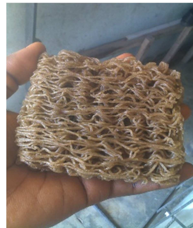
Figure 2. Noodles produced from rice broken rice, bran and AYB.

This indicates a high level of acceptance of the noodle prepared from rice, African yam beans and Rice bran composite flours, thereby improving the nutritional contents and as well as increasing the utilization of African Yam beans and also rice bran which was added as part of the ingredient.