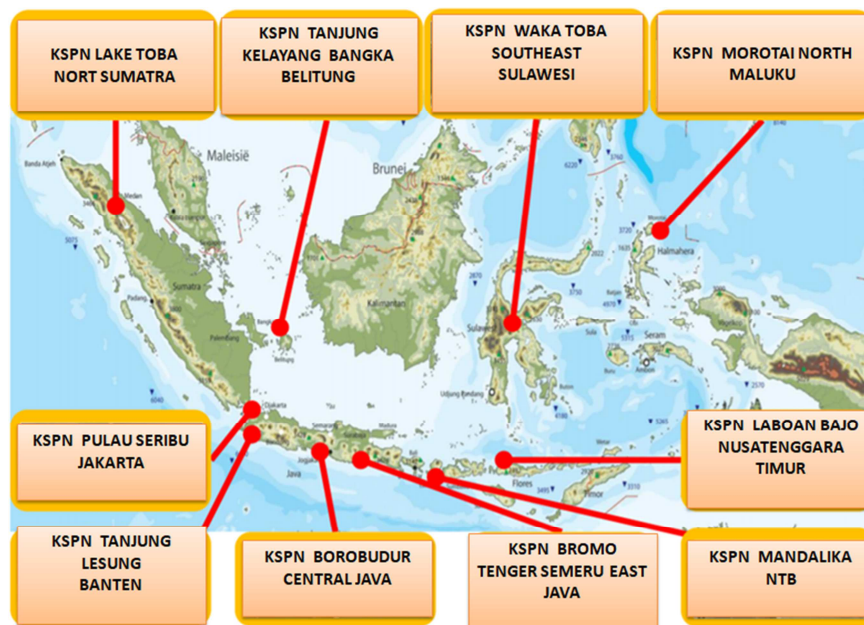
Figure 2. Locations of 10 Priority Tourism Destinations.

Tengger, Semeru (East Java), Mandalika (NTB), Labuan Bajo Komodo (NTT), Wakatobi (Southeast Sulawesi), and Morotai (North Maluku) which are called the "10 New Balis" as specific geographical areas and are equipped with the availability of tourist attractions, public facilities, tourism facilities, accessibility, and interrelated communities, which can be seen from the image below [22, 23].