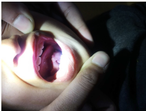
Figure 1. Injury to the floor of the mouth.

On examination, the General condition of the child was normal. He was afebrile, breathing regularly and rhythmically. On local examination, the floor of the mouth was elevated, and there was an incised gaping wound approximately 2 inches in size with exposed muscle with an elevated tongue and there was no evidence of infection as seen in figure 1. Generalized bilateral swelling in the submandibular, submental, and sublingual regions extending to the mid-portion of the neck, with mild tenderness as seen in figure 2. There was no active bleeding, no stridor, and no cyanosis. The patient has been admitted to the emergency & Conservative treatment started. On the next day, Investigations were done. The WBC count was 12000/cumm with polymorphs 80%. The x-ray ST-Neck lateral view revealed soft tissue swelling in the neck but the airway was not compromised.