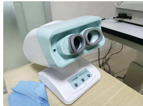
Figure 1. Red Light Therapy Instrument in Ning Bo Eye Hospital.

classification and U.S. FDA laser classification, its radiation category belonged to Class I. According to the China national laser product safety standard (GB7247. 1-2012), radiation Class I could be used safely into the eyes.