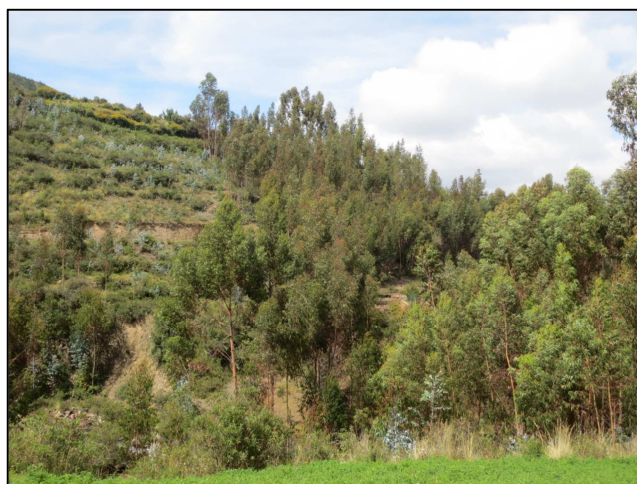
Figure 5. Eucalyptus trees in the community of Taucamarca (Photo by author).

both for household use and as a potential source of income. It is common for a family to have twenty to fifty trees on or around the margins of their land. However, of the thirty-six families reporting the number of trees they owned, forty-four percent said they had more than 100 trees, and twenty-two percent had more than 500 trees. Much of the land in the study communities is marginal, characterized by steep slopes and rocky soils. Agriculture is hindered by low productivity and provides limited opportunities for cash income. However, eucalyptus trees will grow on the marginal plots (Figure 5). The results highlighted the utility of using the marginal lands for fuel and income-producing tree farming instead of low productivity subsistence agriculture. With respect to cooking fuels, an increase in tree planting suggests that the availability of wood in the rural areas of the Cuzco Region could be increasing, and thus will remain relatively more abundant or cheaper than gas.