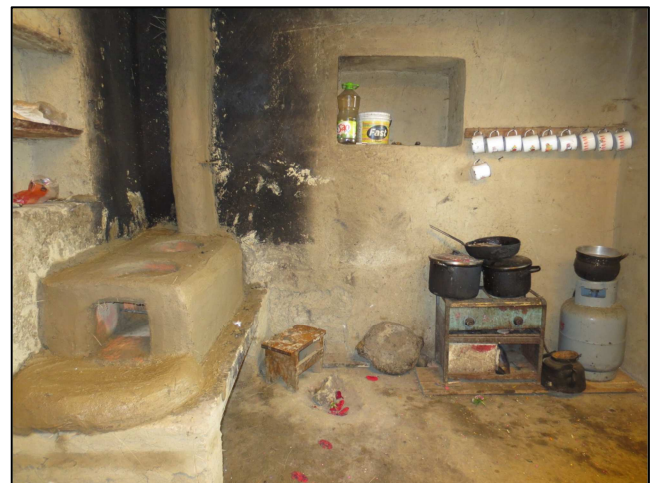
Figure 4. House in Taucamarca with the ProPeru improved biomass stove (left) and a typical gas stove (right) (Photo by author).

Eighty-one percent of the households surveyed in the four communities had gas stoves, indicating widespread diffusion of this fuel and technology (Table 1). However, we learned that gas is used primarily as a supplement to biomass, not as the main cooking fuel. Gas is an emergency fuel. It is used when wood or other biomass is not available, but especially during the rainy season when wood gets wet. People also reported using gas as a fuel of convenience. The gas stove is utilized when people are in a hurry. It is easy to light and can cook something rapidly. This is especially important in the morning to get the children off to school or at night when people cook small amounts or reheat food after a work day. People reported preparing items such as coffee, tea, soup, porridge (oats, quinoa, wheat), rice, fava beans, potatoes, corn, pasta, and eggs. Nevertheless, an additional question in the 2018 survey revealed that only one-quarter of the households used their gas stoves every day, but even in those cases, only as a supplement to biomass (Figure 4).