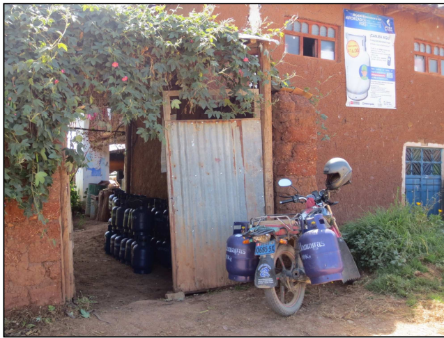
Figure 2. Authorized LPG distributor in the community of Chakan.

do not qualify, as that is an indicator of higher incomes [24]. Tanks of LPG are distributed using a voucher system. Recipients receive one voucher per month which allows them to buy a 10kg tank of LPG for 16 Peruvian Soles (US$5), or half the market price [25]. In the Cuzco Region, FISE is administered by Electro Sureste , which is a regional division of the state electricity company. Vouchers are either physically attached to the paper receipt for the monthly electricity bill or can be received electronically via cell phone. Recipients exchange vouchers for a tank of gas at an authorized distributor, of which there are more than 4,000 nationally [23]. Many rural communities have a local distributor. If not, they receive deliveries by truck or motorcycle, or tanks are available in nearby market towns (Figure 2). With broad access to cellular service in Peru, customers can also order by phone. In 2018, there were 135,176 recipients of vouchers in the Cuzco Region [26].