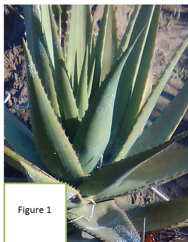
Figure 1. Aloe ankoberensis .

The followings are some of the pictorial representations of the indigenous aloe species identified and reported so far in Ethiopia. All are important and have strong linkage with the cultures of the communities.