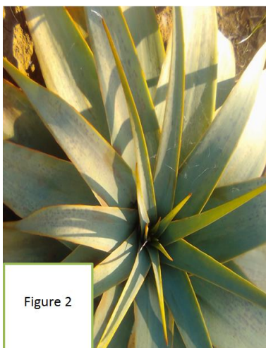
Figure 2. Aloe purcherrima .