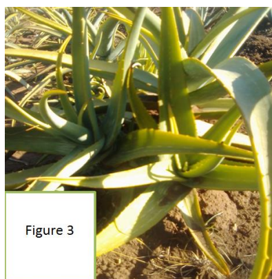
Figure 3. Aloe tewoldei .