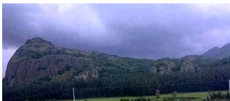
Figure 2. Estie Densa forest reserve.