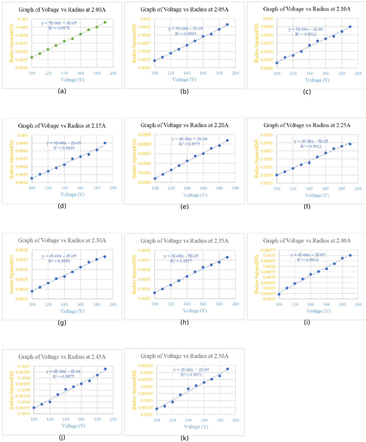
Figure 1. The Plot for constant current with varying voltage data.

The plots show that for a constant current, the radius increases linearly with increasing voltage, with a nearly identical slope across the different current values, indicating a stable proportional relationship between radius and voltage under steady current conditions. The relationship between the accelerating voltage V and the square of the electron beam radius r^2 was systematically investigated over a range of coil currents