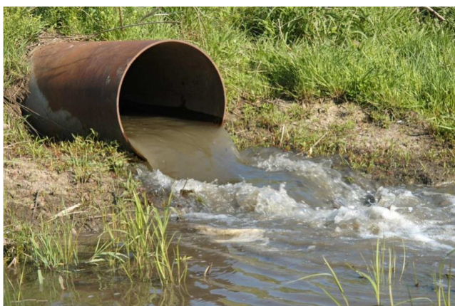
Figure 1. Wastewater is Discharged into Water.

Wastewater discharge directly enters the environment and increases innumerable environmental risks. 126 organic and inorganic hazardous compounds have been identified and recognized by the United Nations Environment Protection Agency and have particular discharge limits. The World Health Organization (WHO, 1989) also established the requirements for wastewater quality before release. In addition to the global standards, regional and national laws have also been established for European Union (EU) member states like Germany, Sweden, and Denmark as well as non-EU nations like Russia, Belarus, Switzerland, China, the United States, Canada, and Dubai. These laws have undergone extensive review. [17, 18]. Figure 1 shows the water discharge of the industrial effluent into the water body.