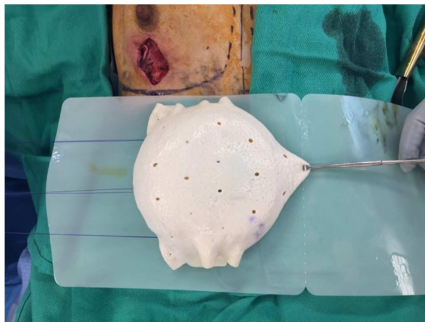
Figure 1. Creation of the implant and ADM construct.

impinge on the pedicle. The construct is further secured to the inframammary fold to allow maximal lower pole expansion of the flap with subsequent expansions. A drain is placed and brought out through the skin inferolaterally. The external remote port of the adjustable saline implant is secured next to but separate from the drain exit site in the subcutaneous tissue. The flap is inset over the implant-ADM construct with interrupted 3-0 Vicryl sutures. The adjustable saline implant may be filled with a small volume depending on the tension upon closure. The mastectomy skin flap is draped over the abdominal flap and the wound is closed. A diagram of the different components of this hybrid reconstruction is illustrated in Figure 3.