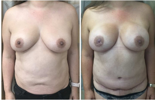
Figure 4. Pre-operative and Post-operative photographs.

Patient preoperatively (left) and 6 months postoperatively (right) following bilateral mastectomy and immediate breast reconstruction with abdominal free flap and adjustable saline implant. The final result is an aesthetic augmented appearance and high patient satisfaction.