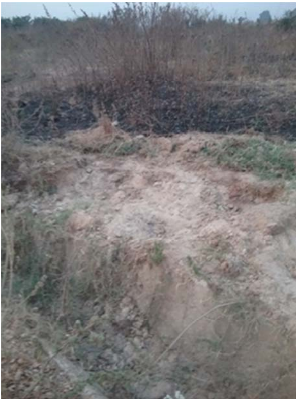
Figure 3. Clay deposit at Giri (Adebowale, 2020).

Site identification: The researcher visited the clay site to collect relevant clay materials around Giri junction, Gwagwalada Area Council FCT Abuja which is noted for abundance deposit through a research informant to negotiate clay site with the district head and chiefs for hitch free clay collection (figure 3). The effectiveness of the clay is ascertained by its strength being clay which has been used by the students and lecturers in the department of fine and applied arts of the FCT College of Education Zuba Abuja for over a decade.