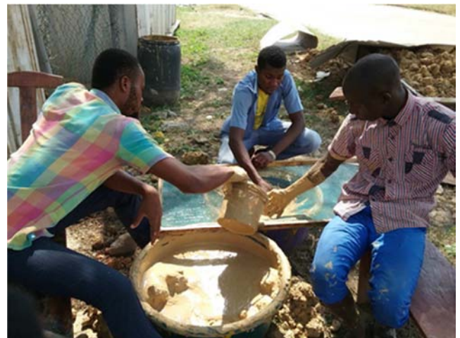
Figure 4. Clay collection and preparation deposit (Adebowale, 2020).

The clay was collected from the site, dried at 90°C for 24 hours, ground by using pestle and mortar into powder to reduce foreign properties (impurities). The clay was soaked inside a plastic drum for another 24 hours and sieved through clothing (synthetic fiber made) mesh to remove lumps by thorough stirring, after which fine slip is settled at the bottom part of another plastic container. Subsequently, the slip is poured inside a wide spread cotton on a flat ground in the sun to allows for evaporation consequent upon solid balls of clay. The clay is wedged by removing air bubbles, cutting the clay in to dough, beating and mixing with hands to achieved balls of clay.