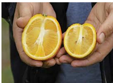
Figure 2. Huanglongbing-infected orange trees bear fruits that are small and lopsided (right) compared with healthy fruit (left).