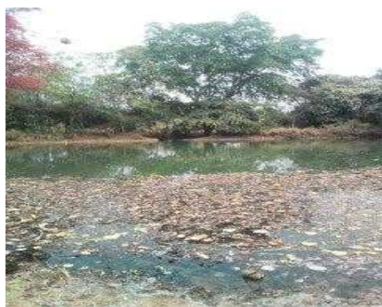
Figure 2. OkposiOkwu Salt Lake.