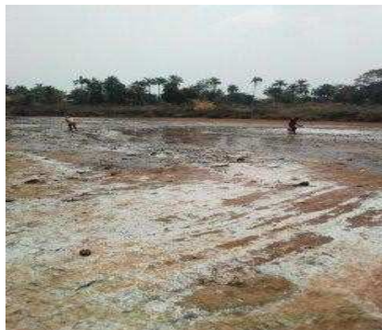
Figure 1. Uburu Salt Lake.

Umuka, Amechi, Amenu; Uburu, AroAkeEze. The picture of Uburu and OkposiOkwu Salt Lakes are shown in the Figures 1 and 2 below;