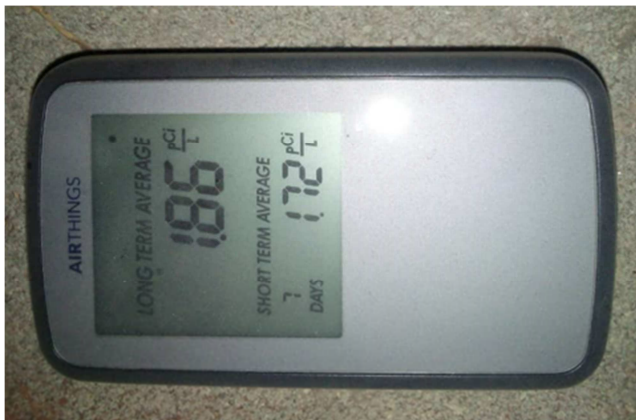
Figure 1. An operational Airthings Radon Monitor at the sampling location.

A pictorial of the airthings radon monitoring device in operation is depicted in Figure 1.