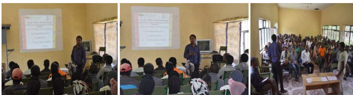
Figure 2. Introductory training to Farmers, DAs, SMS and others participants.

increasing yield in moisture deficit area. Training was organized and given to stakeholder on the objectives and target of the activities to meet specific gaps on the experiment in the implementation of the activities. All FREG members were participated on training to obtain theoretical concept. Farmers, DAs and experts were attended and became aware on the in-situ moisture conservation technologies.