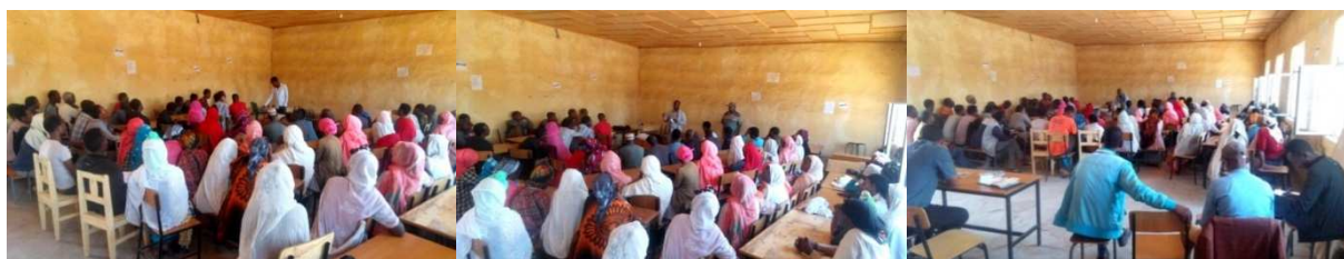
Figure 2. Introductory training given to Farmers, DAs, Animator, SMS and others participants.