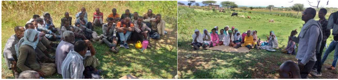
Figure 3. Field day at Negele Arsi (Gubeta Arjo Kebele) and Adami Tulu Jido kombolcha districts (Golba Aluto kebele).