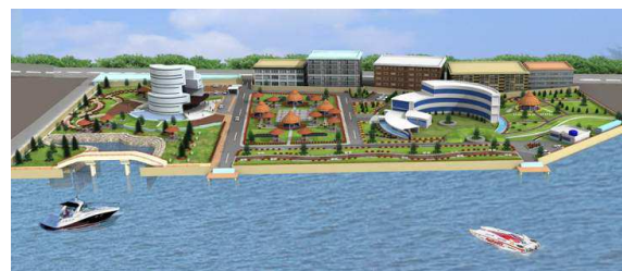
Figure 3. Layout plan of Buriganga Eco-park.

makers of the concern industry to consider the following issues very carefully and on the priority basis for the expected development of the industry. The research site, Buriganga eco-park is not an exceptional one with the increasing demand of the visitors but the problems associated with the visitors satisfaction depends on multi-dimensional issues.