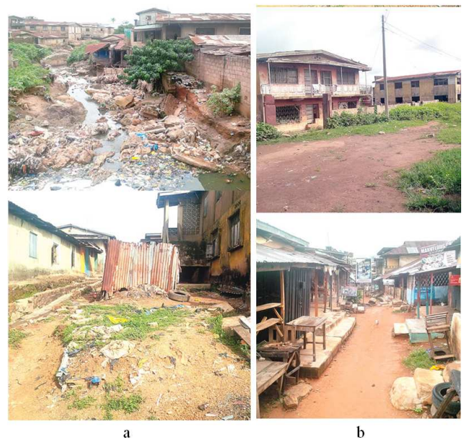
Figure 1. a. Pictures of some of the poor conditions in the Agbowo Community; b. 1 Picture of some of the poor conditions in the Agbowo Community.

The establishment of large organizations like the University of Ibadan to catalyze the development of the surrounding environment may not necessarily guarantee a relatively high level of development (Goddard, 2000). The condition in Agbowo community, the study area is far from the expected development outcome because the community is facing some development challenges; housing congesting, poor drainage system, poor waste disposal management, narrow road network causing traffic congestion, inadequate social facilities over-utilization of existing infrastructural facilities, etc. (Figure 1). There is the need, therefore, to examine whether the establishment and presence of the University of Ibadan near the Agbowo community have had a corresponding positive or negative developmental impact on the wellbeing of people in the Agbowo community. This study, therefore, attempted, to assess the contribution of the University of In to the economic development of the Agbowo community (Figure 1a & b).