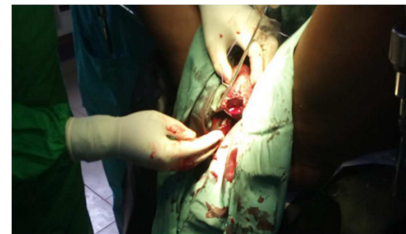
Figure 2. Myomectomy and repair of the bleeding base of excised sub mucous fibroid.