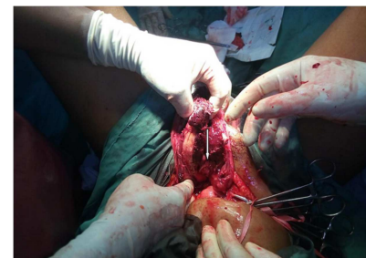
Figure 3. Abdominal view of the uterus after reversal of inversion highlighting a posterior uterine incision from cervical ring to upper uterine segment. Endometrial surface in view (see arrow).