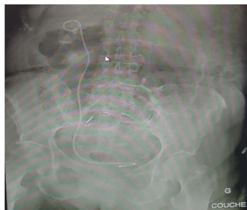
Figure 3. Image of an unprepared urinary tree showing a double J stent on the right well in place with an upper loop at the pelvis level and a loop at the bladder level for urinary diversion.

The patient's status after placement of jj stent and evacuation of the fecal impaction: a good clinical-biological improvement with a normalization of the renal function: Creatininemia at 62umol/l after urinary diversion compared to 196umol/l initially and an infectious report White blood cells at 10,100/mm 3 compared to 14,100/mm 3 and a PCR of 12.5mg/l compared to 119.7mg/l.