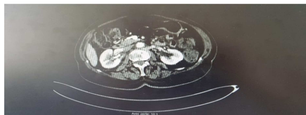
Figure 4. CT scan injected showing disappearance of the leakage of contrast material and the absence of dilation of the pyelocaliceal cavities with a JJ stent in place.

The patient's status after placement of jj stent and evacuation of the fecal impaction: a good clinical-biological improvement with a normalization of the renal function: Creatininemia at 62umol/l after urinary diversion compared to 196umol/l initially and an infectious report White blood cells at 10,100/mm 3 compared to 14,100/mm 3 and a PCR of 12.5mg/l compared to 119.7mg/l.